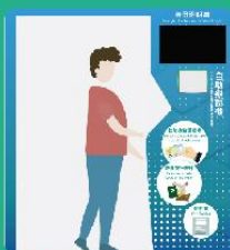
DSI self-service document application kiosks

After successful enrolment at self-service document application kiosks, applicants can use the e-Channel service to enter and exit Hong Kong in approximately 3 hours.